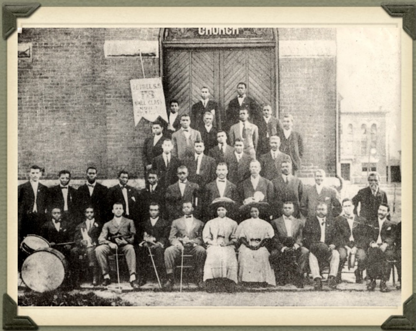
Bethel A.M.E. Church 1890's