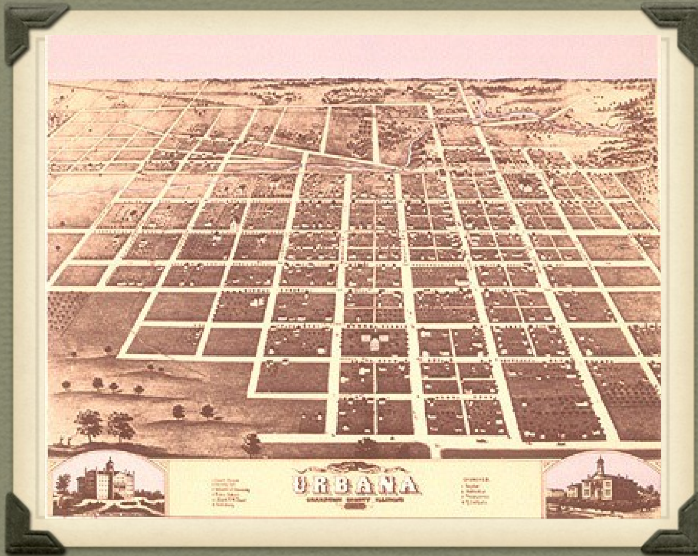
Urbana in 1869