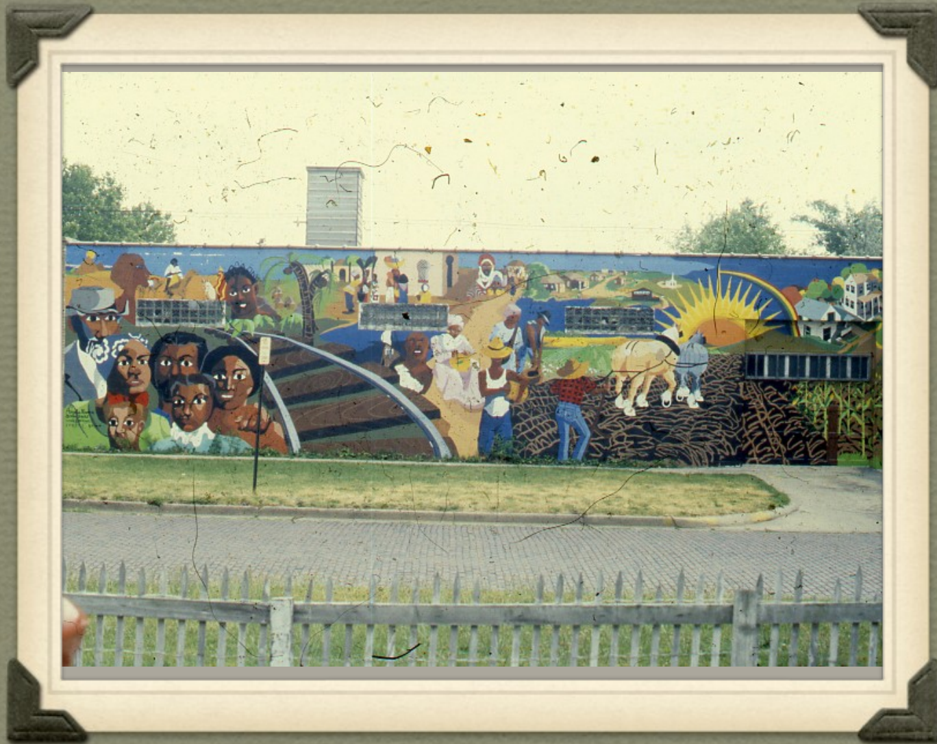
The mural 1978