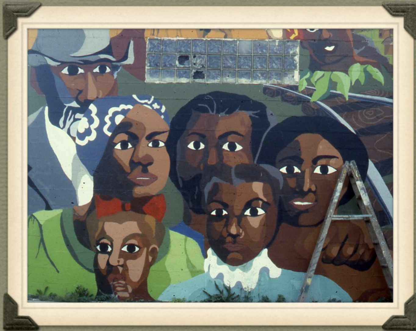
The Mural's Central Family