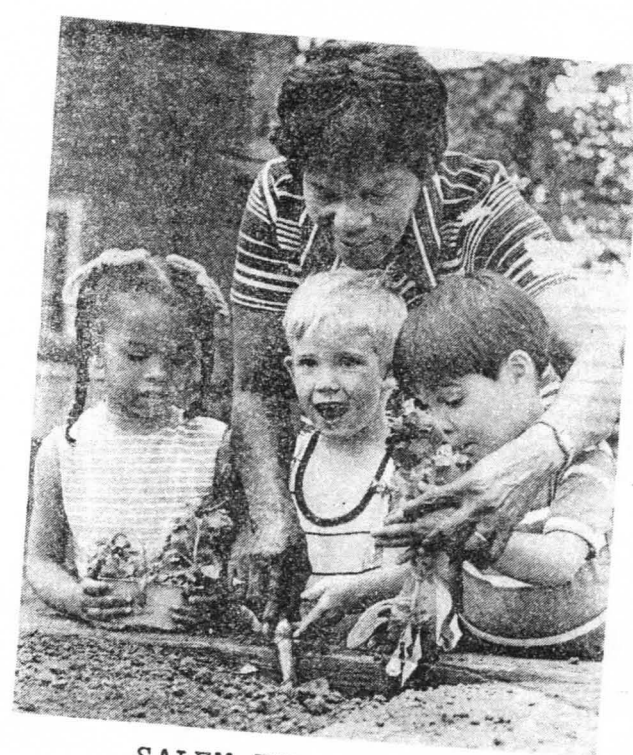
SALEM PRE-SCHOOL 500 E. Park Champaign, Illinois 356-8176

When you help a child, you help yourself"