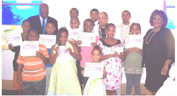
McKinney-Lewis Scholarship Awardees