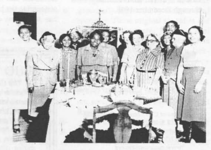
The War Mothers of World War II, a unit of the national organization was organized to support their sons in service. These women were very active in the war effort as well as civic and defense and war related activities