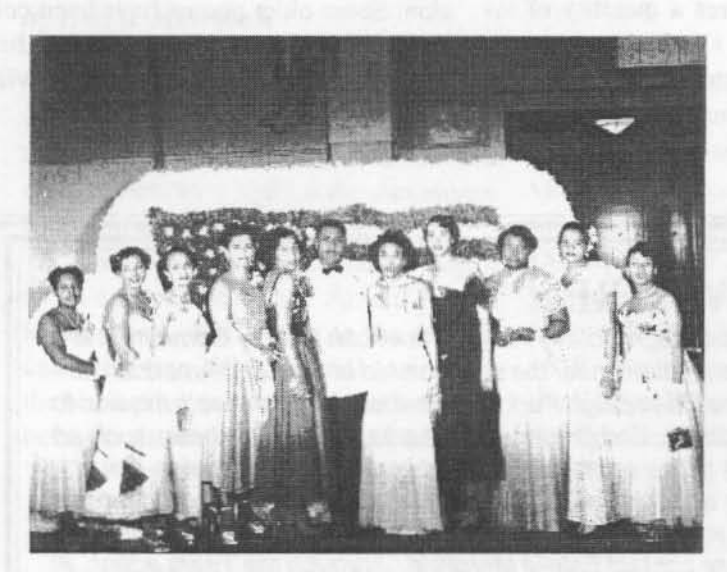
The Royalettes and one of those memorable "Christmas in July" formal galas held in the Champaign Armory. The decorations were beautiful and the participants decked out in their finest attire.