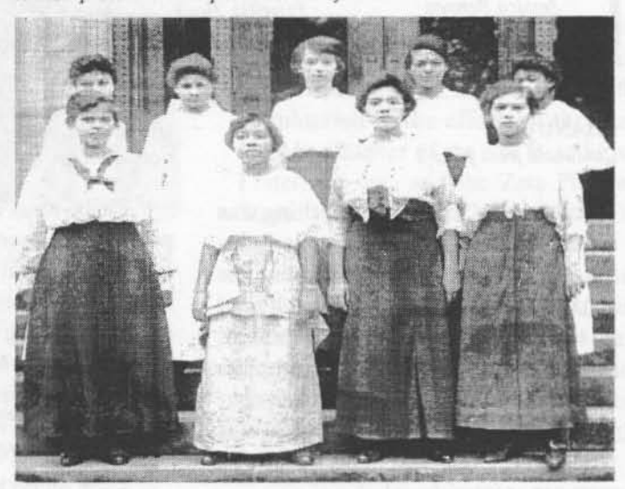
In 1915, these nine young ladies of Gamma Chapter of Alpha Kappa are shown on the steps of Altgeld Hall on the U of I campus. The national organization was founded in 1908. The local chapter chartered in Champaign in 1914 is still in existence fostering educational excellence and community service.