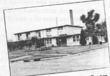
Douglass Community Center

Plans for the Douglass Community Center began in 1940 because the black community's needs were not being met with the inadequate, segregated facilities which existed. A house adjacent to Douglass Park, in which the community had carried on its recreation programs, was donated. An organization known as "The Douglass Community Service Committee" was formed, and fundraising began to build a recreation center.