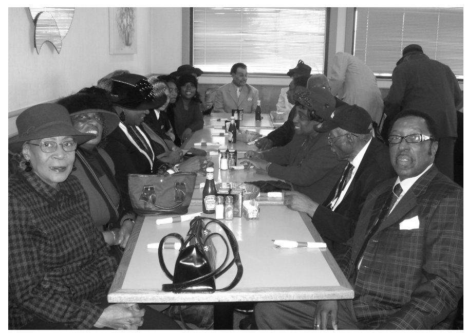
Pilgrim Missionary Baptist Church seniors enjoying a recognition dinner at Urbana Garden.

On Sunday, December 21<sup>st</sup>, 2008, Pilgrim celebrated their annual Senior Recognition Day. Each year, time is set aside to give honor and appreciation to those who have paved the way for Pilgrim as a church as well as Champaign-Urbana as a community.