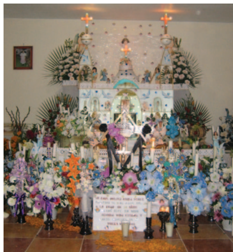
On the eve of "Día de Muertos," families in Tlapanala, Puebla, put up large "ofrendas" for relatives who died within the last year. Visitors can view the "ofrendas" and spend time with the dead relatives.

children's understanding of the surrounding practices and beliefs related to death) when looking at their conceptions of death. ■