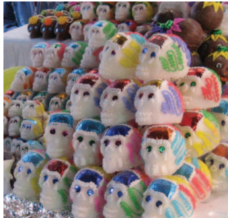
Sugar skulls are on display at a market in San Pedro Cholula, Puebla, days prior to the main celebration. They can be given as presents with the recipient's name written on the forehead to honor living friends.

Our main goal is to provide a more comprehensive perspective for studying children and death within a cultural context, something that is relatively new to the field of developmental psychology. For this, we have explored children's developing conceptions of death by combining data from several methodological perspectives (e.g., ethnographic inquiry, parental reports, and children's direct reports). We also focused on children's socialization with death, including their involvement in practices related to death and dying, and parental assessments about children's involvement in these rituals. In terms of cognitive development, this is the first study to incorporate information about the cultural meaning systems surrounding children (e.g.,