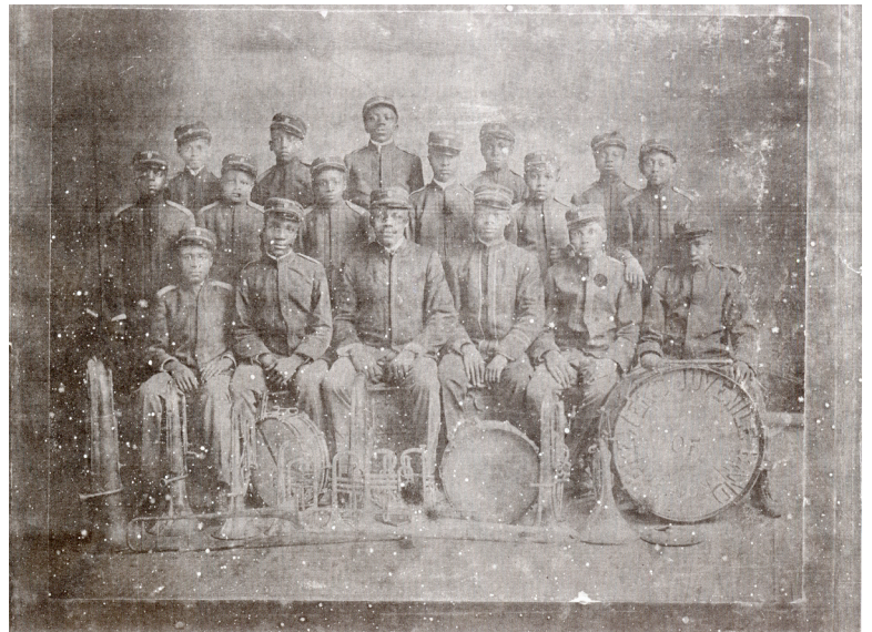
Brewer's Juvenile Band