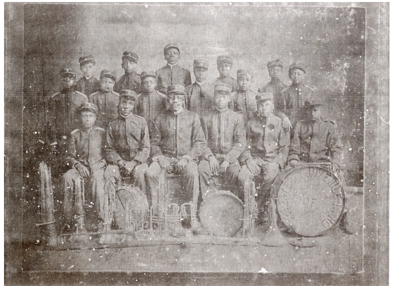
Brewer's Juvenile Band