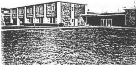
James C. Wilson Student Union Building