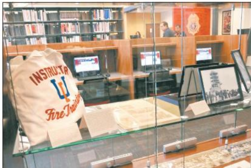
At left, the center's new library is seen through the display windows in the entrance hallway. The library features more than 18,000 items in its multi-media collection.

... they coughed up blood, then raped and robbed.