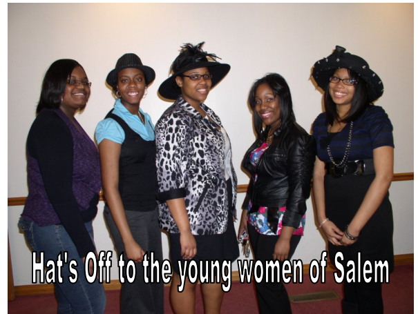
Hat's Off to the young women of Salem