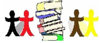
21st African American Read IN