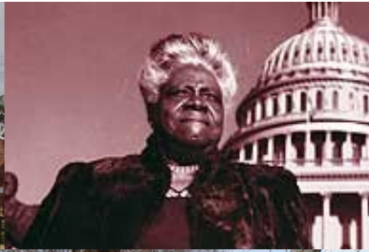
Dr. Mary McCleod Bethune