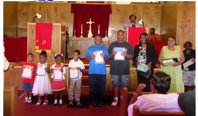
High Achievers, Honor Roll Students and Graduates.