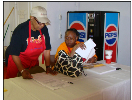
Registration team members setting-up .

The following mission statement and client participation guidelines were adopted by