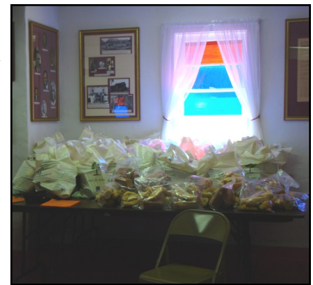
Bagged food ready to be distributed