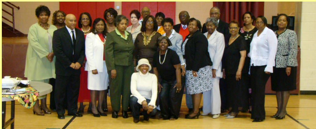
Palm Sunday Tea Chairman, Co-Chairman and Birthday Month Chairpersons