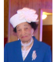
Mrs. Ethel Kennedy

"Let your light so shine before men, that they may see your good works, and glorify your Father which is in heaven." Matthew 5:16