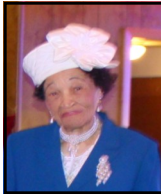
Mrs. Ethel Kennedy