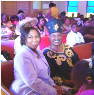
First Ladies Shaw and Buchanan