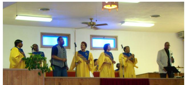
St. Luke Ensemble