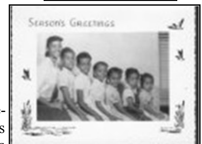
Father of eight children. (Only seven in this picture)