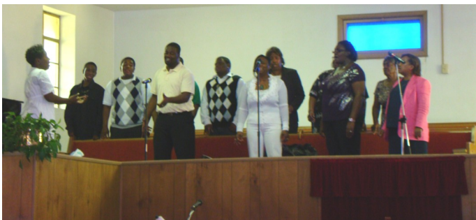
Walls Memorial CME Choir