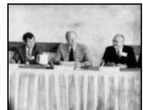
Advisor to Pres. Gerald Ford