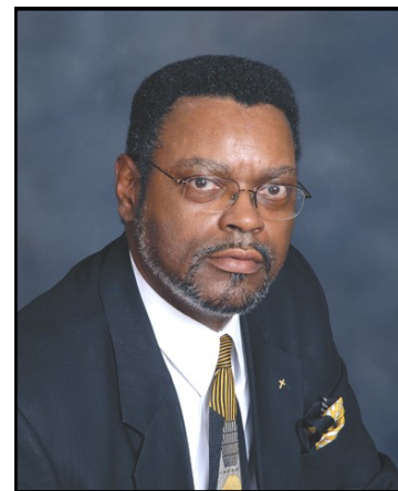
Minister Phillip March