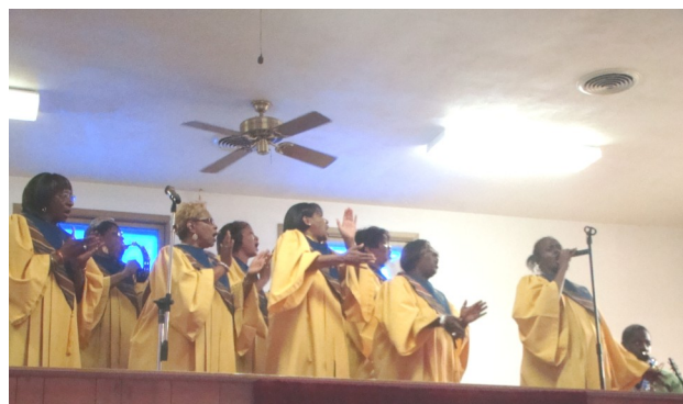
New Life Choir