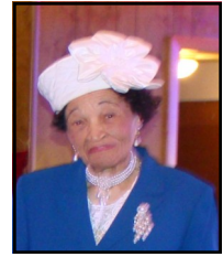
Mrs. Ethel Kennedy