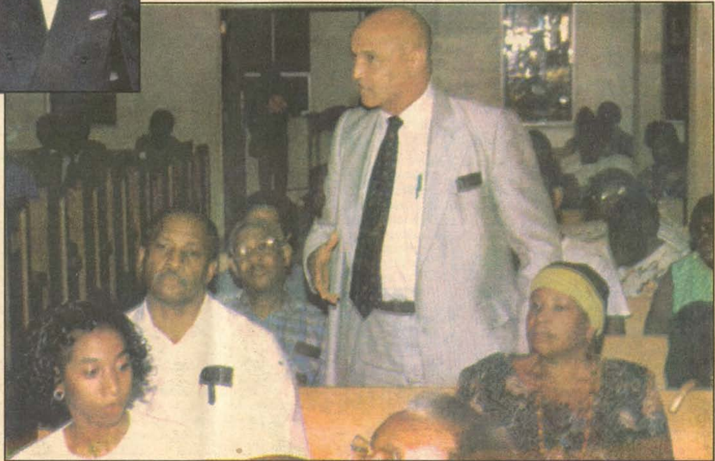
Questions from the floor.