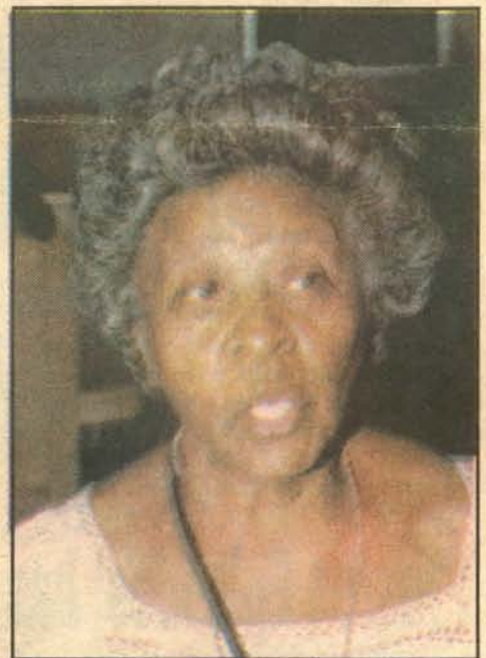
"I got a plan," says this community resident.