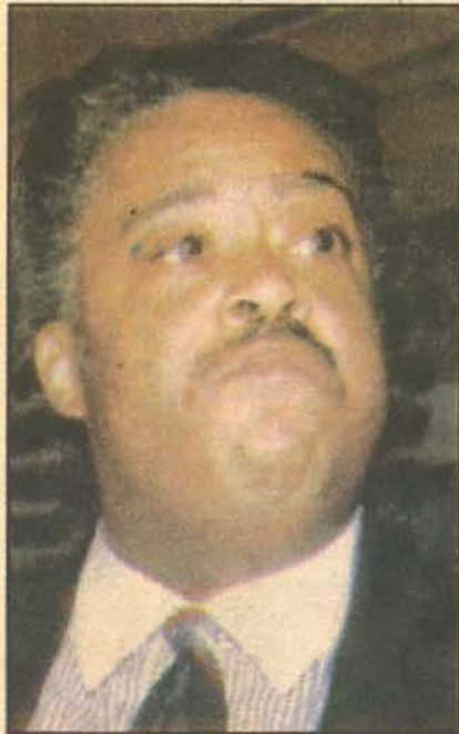
Rev. Al Sharpton