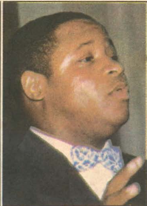
Minister Kevin Muhammad