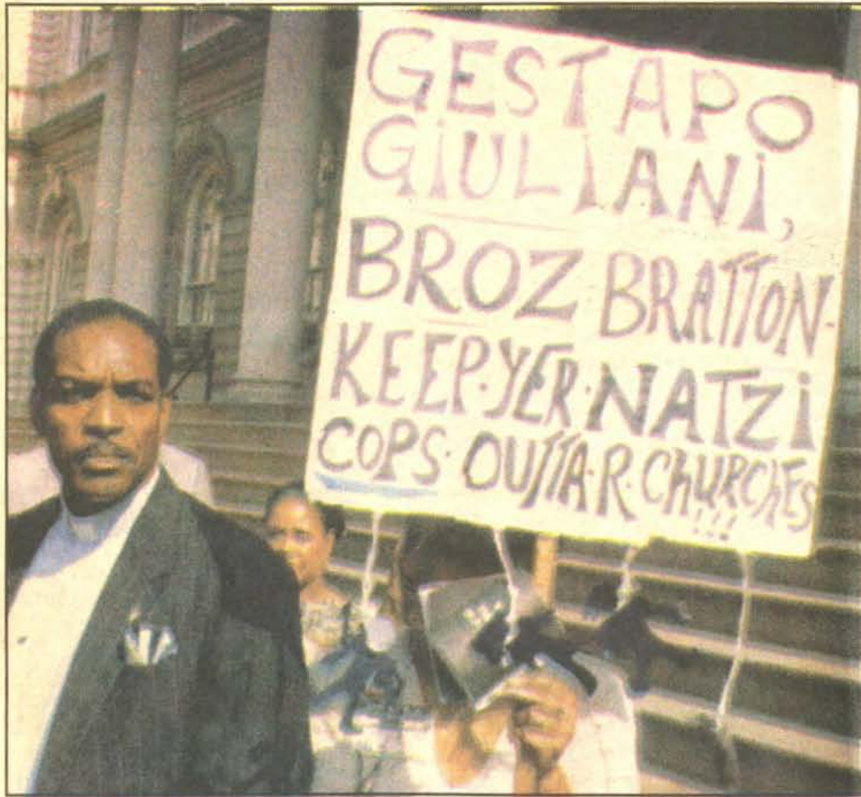
Sentiments for the occupants of City Hall and One Police Plaza.