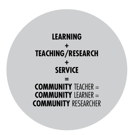
Figure 3-2. Community inquiry approach to service learning

inner-city neighborhoods to rural villages, exploring how individuals and institutions—for example, schools, libraries, grassroots groups, health agencies, and so on—come together to develop capacity and work on common problems. It addresses questions of community development, learning, empowerment, and sustainability in the context of efforts to promote a positive role for information and technology in society.