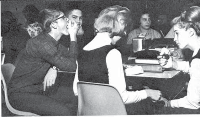
Obviously, many sophomores agree that "an apple a day keeps the doctor away."