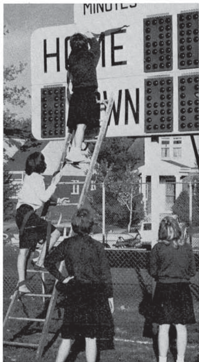
Following CHS tradition, the Pepettes decorate McKinley Field to inspire a Homecoming victory over Decatur.