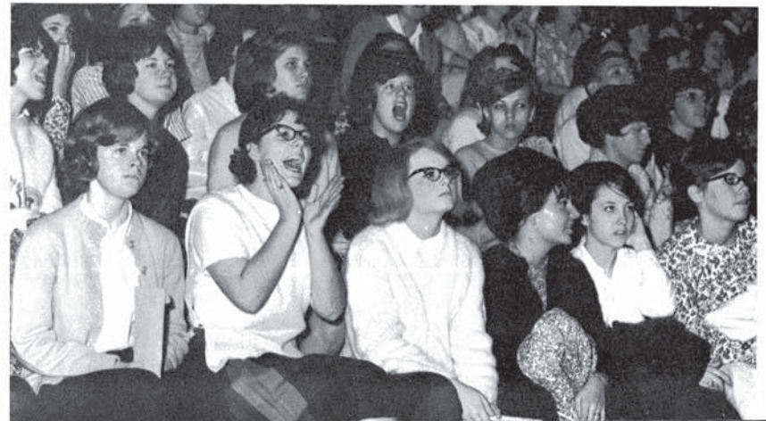
Underclassmen's faces show concern as they watch the basketball team in action.