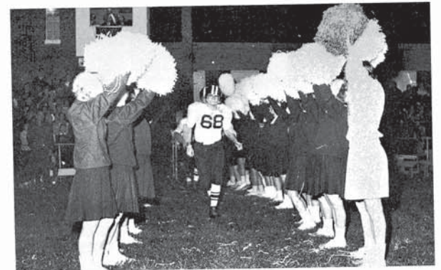
As the football team comes on the field, the Marching Maroons form a victory aisle for them.