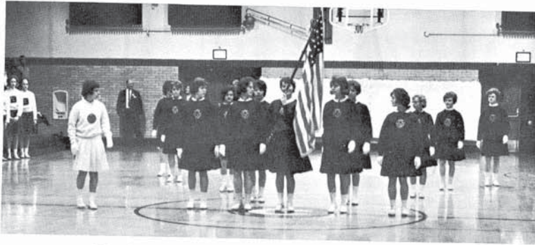
During the basketball season the Marching Maroons lead the traditional flag ceremonies.