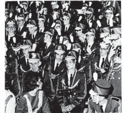
The Champaign Band at ease between numbers.

"High tosses, horizontal tosses, wheels, finger twirls, and grass cutters are some of the jargon of baton twirling which is very familiar to the Majorettes. In the fall five students were picked to lead the band in pre-game and half-time routines.