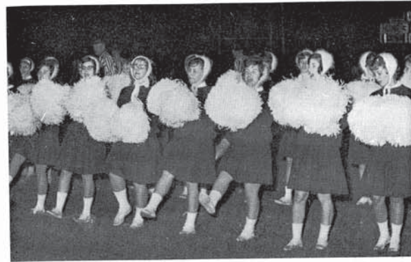
The Marching Maroons serve as enthusiasm-boosters as the Urbana football game gets underway.

During the year '63-'64 the Marching Maroons, who until this year were called Pepettes began a new project. Eight girls were selected to make up a Big 12 Honor Court, an addition which helped to make the Marching Maroons a more colorful and interesting group.