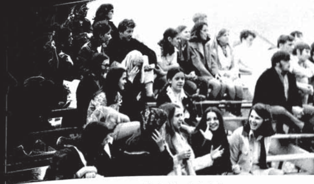
Fans are numerous and enthusiastic at a Central High doubleheader baseball game.