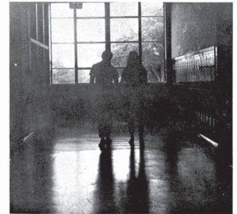
Oh, spring . . . BELOW: "Jazz 70" was a great way to spend a night with our talented Jazz Band in a popular nightclub atmosphere.