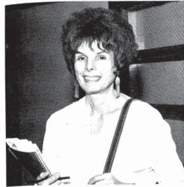
on the other side of the desk