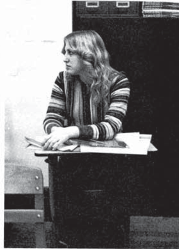
rosemary puts it together