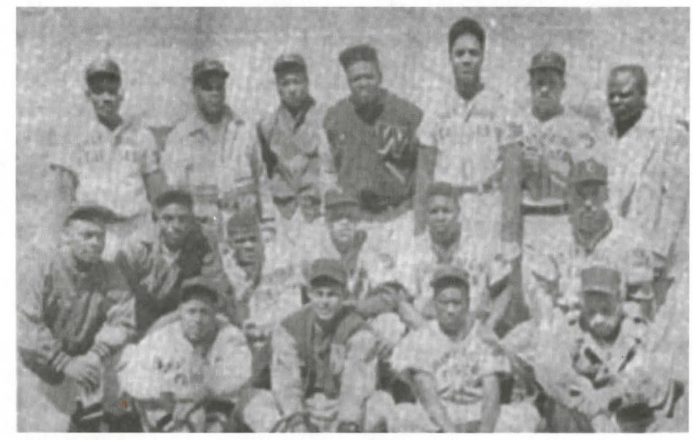
The Eagles were Eastern Illinois League Champions in 1957.

The Champaign Eagles team was one of the hottest teams in the Eastern Illinois League during the 1950s and 1960s. Sundays at old Eagles Park were something of a social occasion and the team's away games would draw a caravan of cars. Fans everywhere loved to watch the Eagles play. Newspaper articles noted their habit of making a strong bid for the championship in the final stretch of the season. They were good competition. The Eagles were the League Champion in 1957; shared that title with Buckley and Gifford-Flatville in 1959; with Buckley and Royal in 1960; and finally with Rantoul in 1966. They were Tournament Champs in 1960.