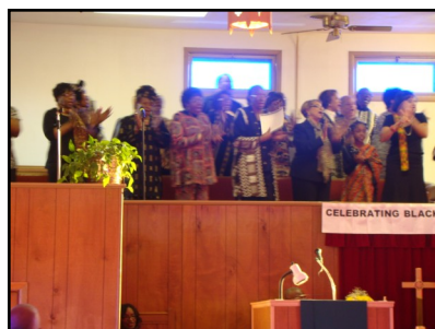
St. Luke's New Life Choir