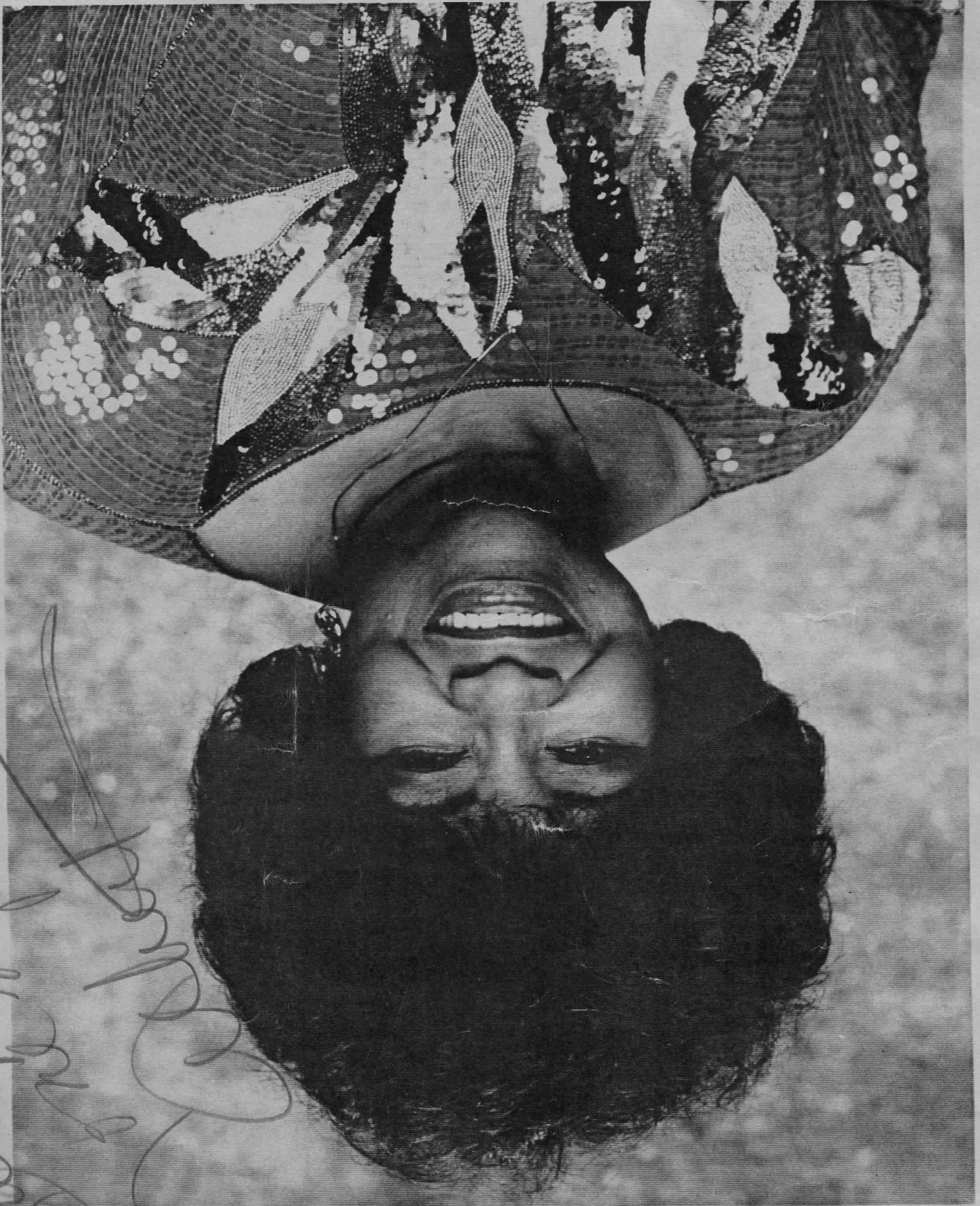
Speaker at our Luncheon at Jumer's, June, 1992